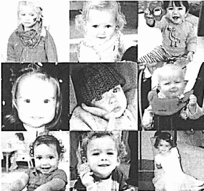
Just a few of the many babies served by the hearing loss Early Intervention program at Minute Man Arc in Concord, supported by Decibels Foundation.